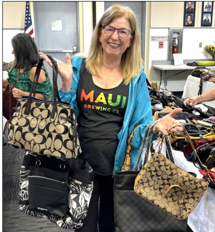
Many purses made for many smiles at Purses For a Purpose!

It applies to this story of many people coming together to work toward a shared goal: supporting Oceanside Public Library.