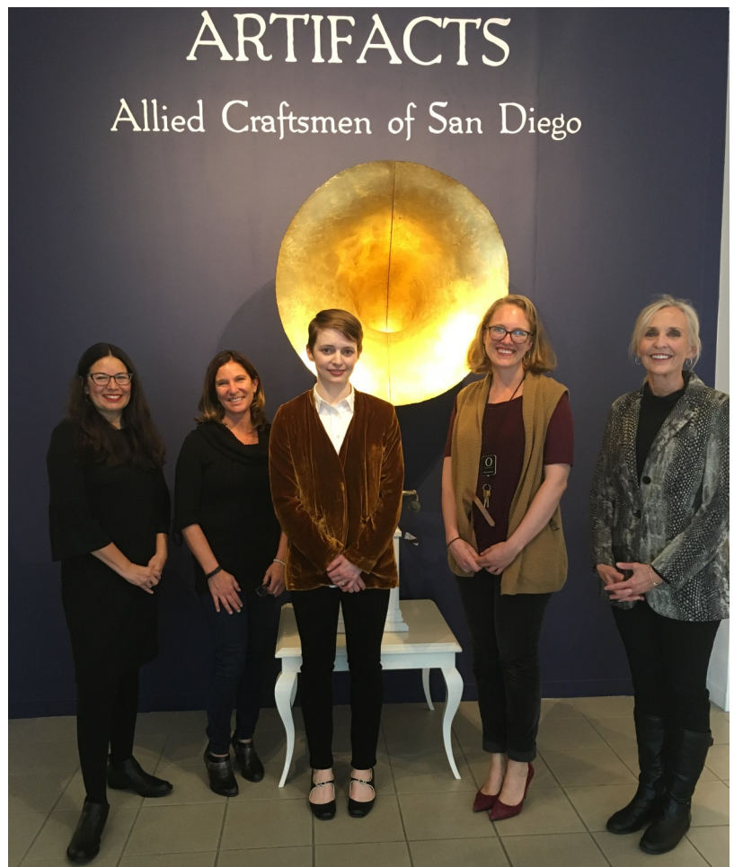
Author of Station Eleven , Emily St. John Mandel, center, after a Big Read event, along with staff from the Library and the Oceanside Museum of Art.