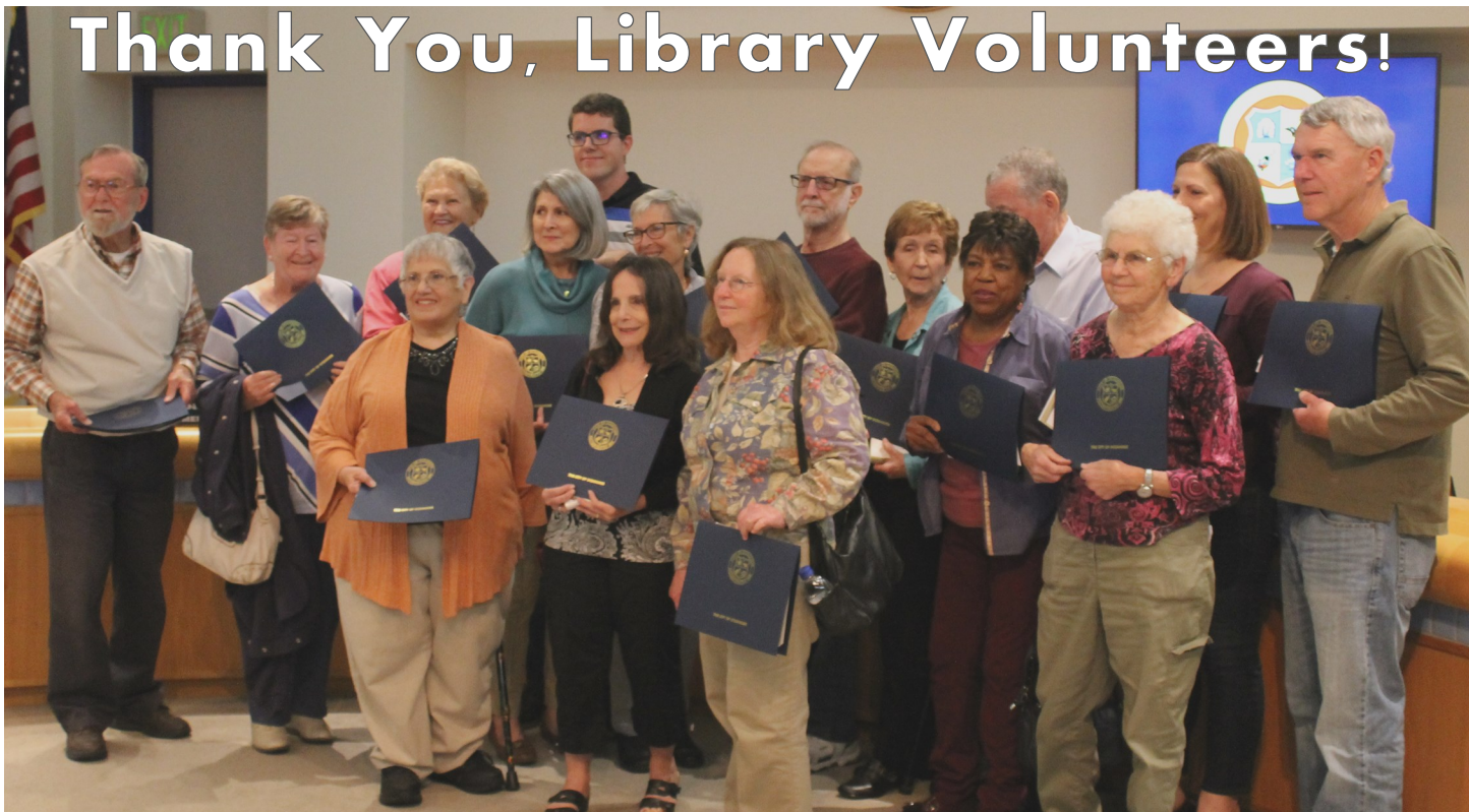
The winners of the 2017 Volunteer of the Year award pose for a group photo after being recognized for their hard work at the annual Library Volunteer Appreciation event on April 27, 2018, in Oceanside City Council Chambers.

The Oceanside Public Library is fortunate to have around 250 adult volunteers who are involved in everything from shelf reading to archiving historical Oceanside artifacts; from helping to run children's programs to tutoring adults so that they may improve their literacy; from assisting patrons on computers to selling used books in order to help the Friends raise funds for the Library.