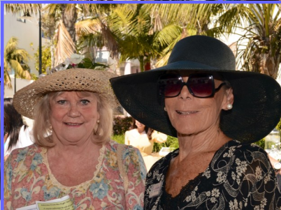
Lovely people and beautiful tables adorned the recent High Tea Fundraiser.